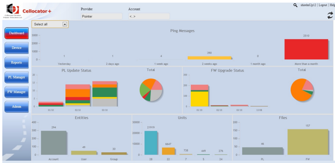
Cellocator + 2.0 Dashboard

Cellocator+ is designed to monitor, configure and upgrade Cellocator units, so that controlling all firmware versions and upgrading units or groups of units becomes an easy task. Assume a situation where within a fleet of 240 units, only units with 2 analogue inputs and a specific firmware version require an upgrade. Cellocator+ automatically identifies the specific units and performs the required upgrade.